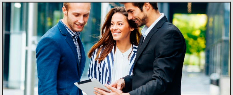
Complaint handling and regulatory reporting